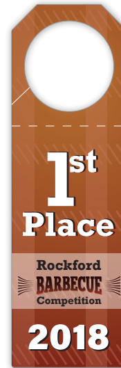
No. 1485, 1491 2¼" x 7"