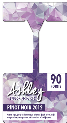
No. 1121 4½" x 3½"

Shelf Talkers are 4-color process printed on gloss white plastic approximately .010" thick.