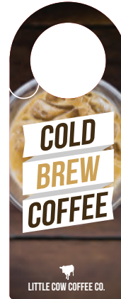
No. 1482, 1489 2½" x 5¾"