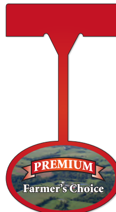
No. 1122 4½" x 3"