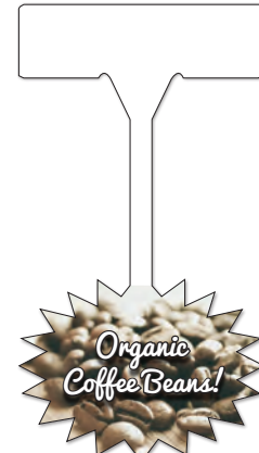
No. 1123 4½" x 3½"