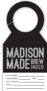
No. 1481, 1488 2¼" x 4½"

Choose from our three stock sizes or create your own shape. Contact us for pricing on custom sizes.